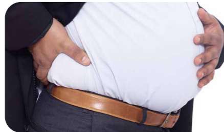
Difficult Breathing due to overweight