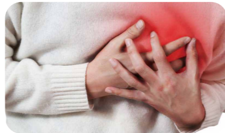
Patients with cardiovascular disease