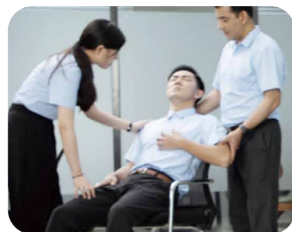
Patients with Respiratory disease (Asthma, COPD)